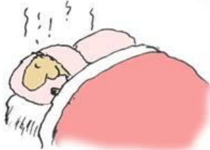
essence of clean sheets.