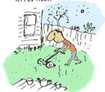
essence of saturday afternoon