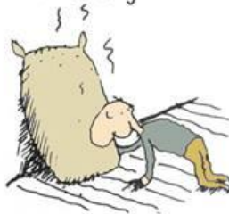
essence of wheat bag