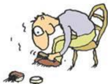
essence of shoe polish