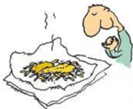
Essence of fish and chips