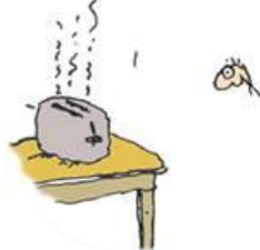
essence of burnt toast